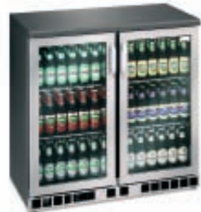
- Option: All types with swing doors, front or exterior in stainless steel (AISI 430)

Remark: Undercounters only need ventilation at the lower front side. This allows the cabinets to be built in completely without leaving any space at the sides and top and a minimum of space at the back side.