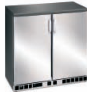
- Option: All types, finish in solid swing doors, anthracite and stainless steel front (AISI 430) (in lieu of glass doors)