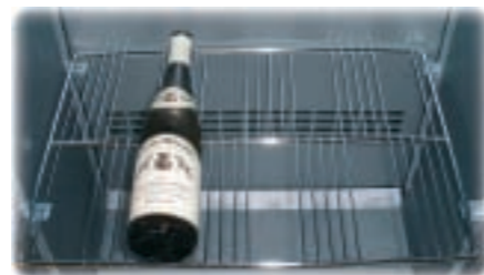
- Option: Wine shelves