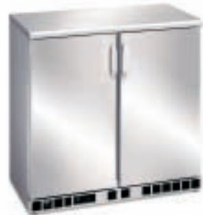
- Option: All types, finish in solid swing doors, stainless steel (AISI 430) (in lieu of glass doors)