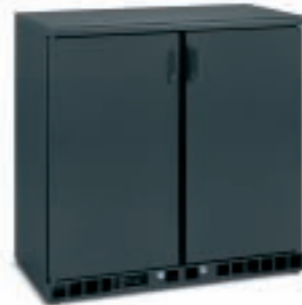
- Option: All types, finish in solid swing doors, anthracite (in lieu of glass doors)